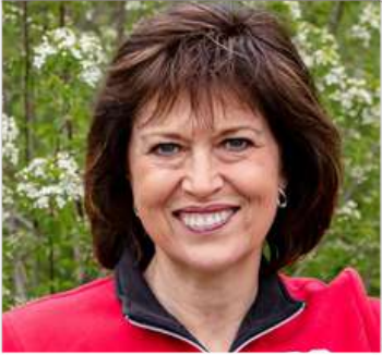
MINISTER PAM DAMOFF